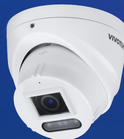
VIT04A-W 4MP Turret AI Camera